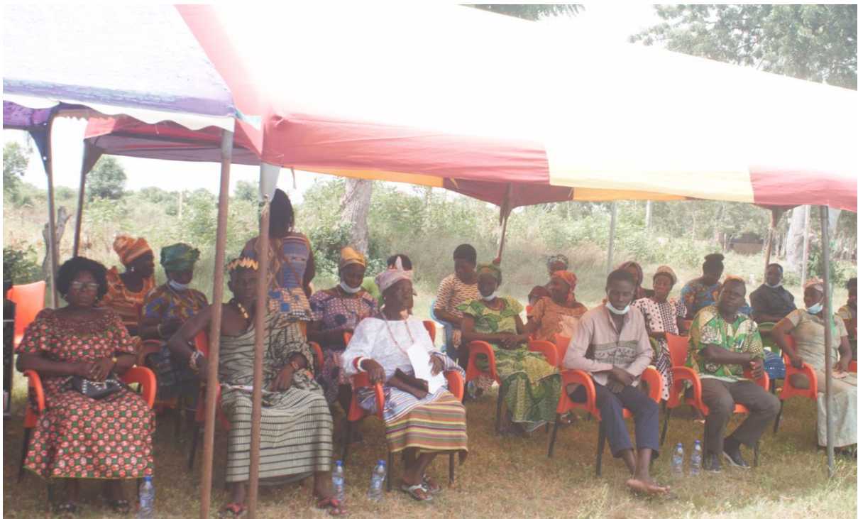
Picture 2: Chiefs, Queen Mothers and Elders from the different participating communities